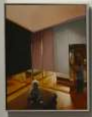
Small text caption for the photograph on the left.